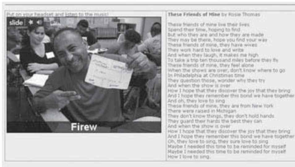
Slide.com is a free tool that puts music to a slideshow. REEP students took pictures of each other on the first day of class and the teacher embedded the slideshow on a free wiki in time to view it during their first computer lab class.

a wiki through professional development activities, which plant the seed for use in instruction. They access self-directed tutorials, which are created to support their instructional needs or develop their technical skills. In March, we launched two pilot projects that involve teacher collaboration with staff using wikis: an online reflective practice group and a portal to local community services and information, such as job applications and government assistance forms.