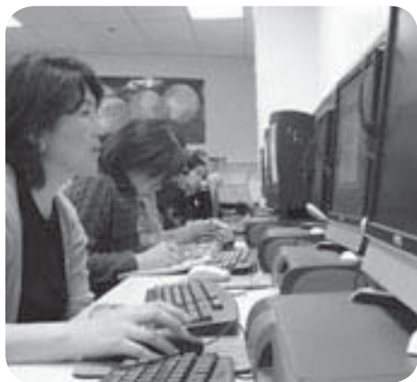
REEP students use a variety of language software during weekly computer lab class.

In the United States today, computers and the Internet are mainstays of our personal and professional lives. From offices, agencies, and schools to supermarkets and subways, the social transactions of our lives are going digital , and at a rapid pace. Yet, while computer ownership is increasing, the Digital Divide – the gap between the ‘haves’ and the ‘have nots’ – is barely closing. As our society increasingly conducts its services, schooling, and even socializing online, the Digital Divide is being re-defined and expanded to include many more factors, including online skills and autonomy and freedom of access, which contribute to greater digital literacy and equality . 1